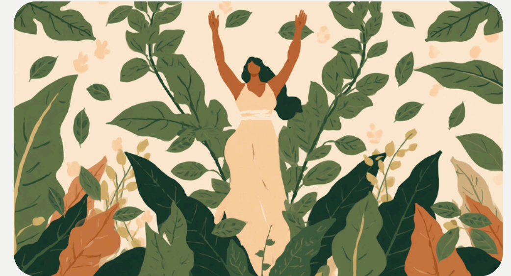
Body as Liberation, Protest & Resistance